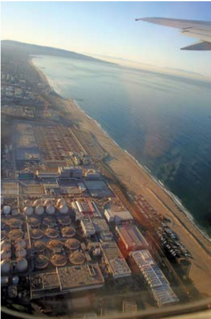
FIGURE 16B2-1 Sewage treatment plants are often located on the water's edge. This large secondary-treatment, the Hyperion plant in Los Angeles is located on a prime stretch of Pacific Ocean beach just west of Los Angeles International Airport.

The most fundamental and unavoidable wastes produced by human populations are human feces and urine. Almost all cities, towns, and villages in the United States and all the world's major cities have extensive sewer systems to collect these materials and transport this sewage away from our living environment. The development of sewers was probably the single most effective advancement for human health protection in history. In the Middle Ages, sewage was simply thrown into the streets in many cities. Apart from the obvious aesthetic problems caused by human excrement in the streets, this practice almost certainly fostered the devastating plagues of disease that decimated urban populations of entire continents during this period. Hence, for many decades, the practice of collecting sewage and discharging it into a river or ocean to be diluted and washed away was viewed as essential and beneficial. This view has changed almost totally since the 1970s.